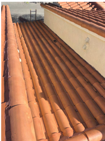
Tile Roof (Cracked Tiles)