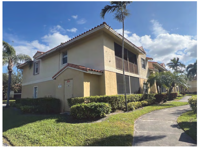
Rear/ Right Elevation