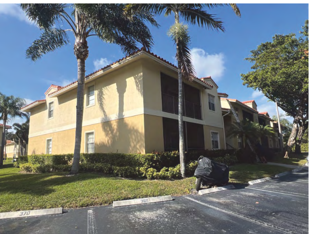
Front/ Left Elevation