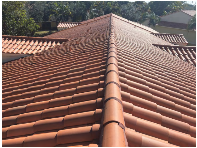
Tile Roof (Cracked Tiles)