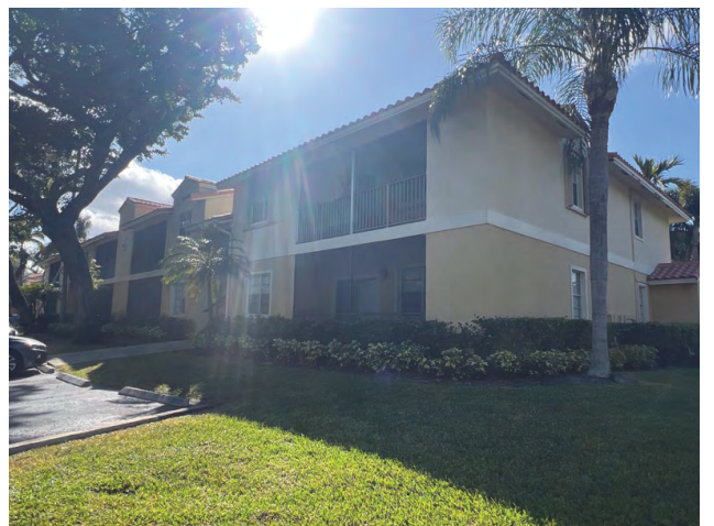
Front/ Right Elevation