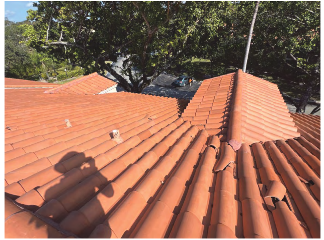
Tile Roof (Cracked Tiles)