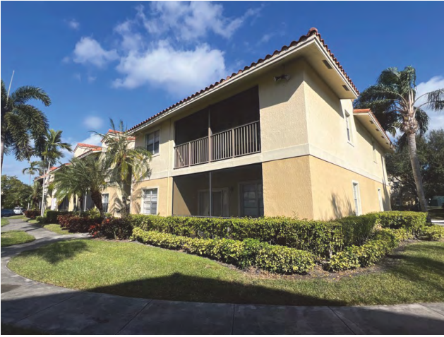
Rear/ Left Elevation